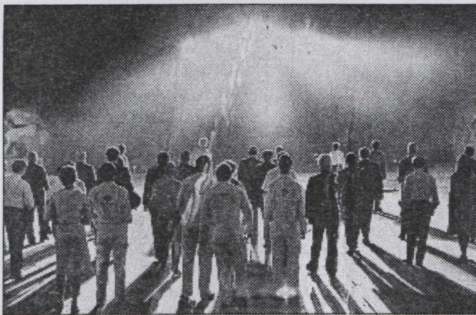
SCIENCE FICTION: How they saw it in Close Encounters

tors, or do they know something that the rest of us don't?